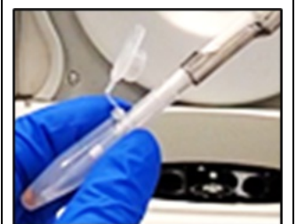
Figure 5: Using the tip of a pipette, carefully remove all of the remaining Wash Buffer that has collected just below the magnetic bead pellet.