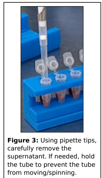
Figure 3: Using pipette tips, carefully remove the supernatant. If needed, hold the tube to prevent the tube from moving/spinning.